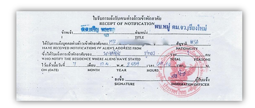
Example of Receipt of Residence Notification

Noted: International Students <u>should</u> inform IAU office every time when you depart from Thailand and arrive in Thailand.