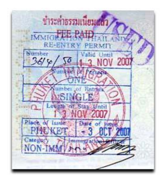
Example of Single entry

If you have a Non Immigrant Visa and leave the country on a re-entry permit, your 90-day checkin count restarts at 'Day 1' when you re-enter Thailand.