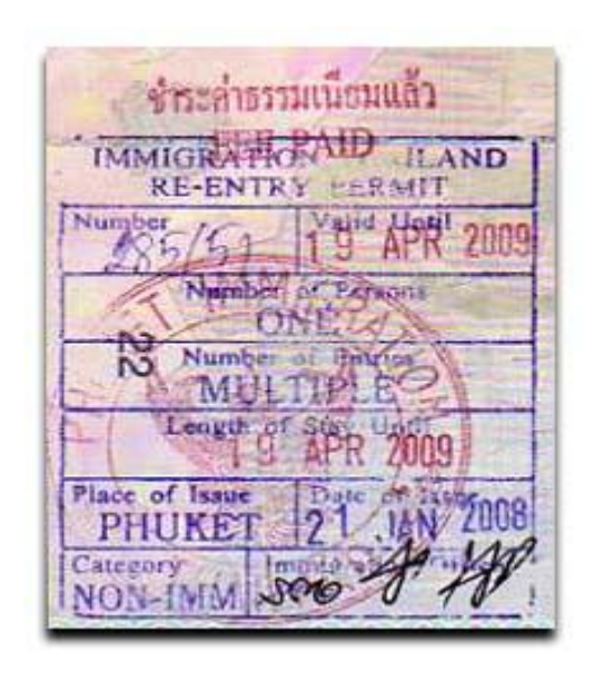
Example of Multiple entries

Alien who hold a 1 year visa or Non-Immigrant vasa has to contact the Immigration Office before leaving the Kingdom to stamp a Re-Entry permit at Immigration office only cannot do at the airport immigration.