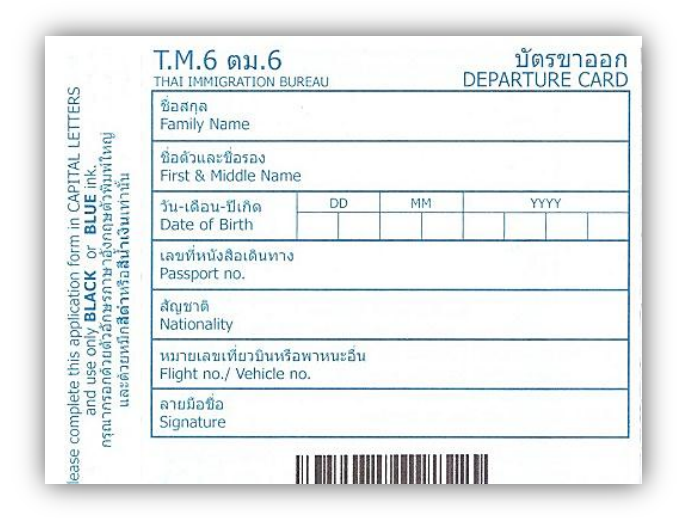
Example of Arrival and Departure card (T.M.6)

There are two sections on the card form T.M.6 – Arrival Card and Departure Card. It is important to fill all the details on both sides of Arrival Card when entering the country however; you can fill Departure Card as well because the only thing that can change there is the number of your outbound flight.